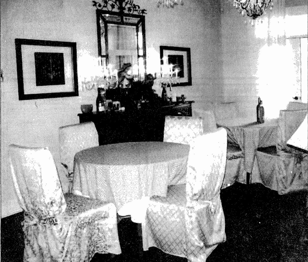
The Belle Oaks dining room has the gracious living look - it's also the place to enjoy a south breakfast - eggs, grits, biscuits, gravy, the works.