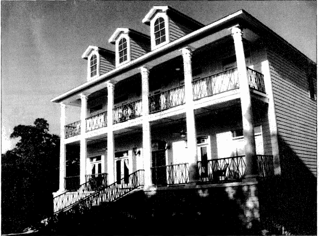
Belle Oaks offers the ultimate in southern comfort to B&B guests.